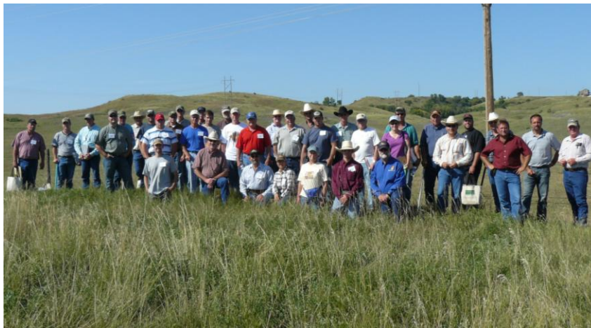
Participants from 2009 SD Grazing School

Thank you to all of the Planning Committee who made this school such a great success. We extend a thank you to Al's Oasis and the Lower Brule Tribe for the use of their facilities during the school.